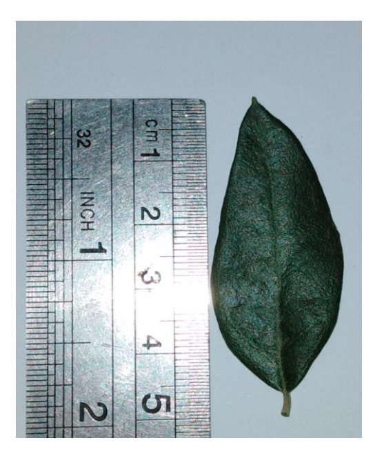
Fig. 2. Morphology of Koroneiki leaf

During oil production, a large amount of the leaves are accumulated as a waste product. Although several recent studies have proved the importance of the leaf extract as an available rich