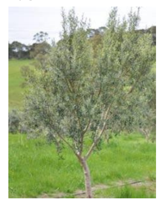
Fig. 1. Koroneiki olive tree grown in Egypt

quality and low acidity oil production (Monograph on olive cultivars, HRI).